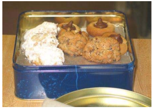
An example of the sample cookies that everyone brought home and hopefully shared!

Best regards, Laurie Meier - N1YXU 936-271-1096 n1yxu@arrl.org